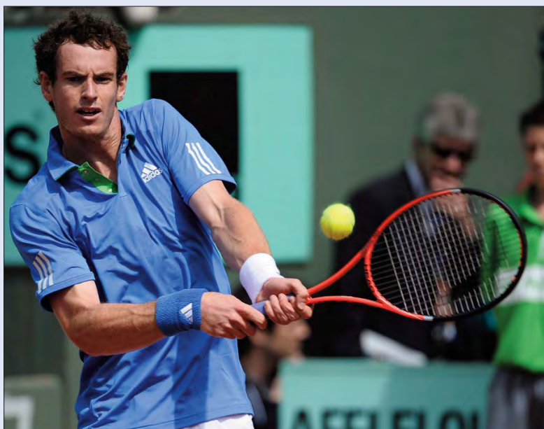
Andy Murray (GBR)