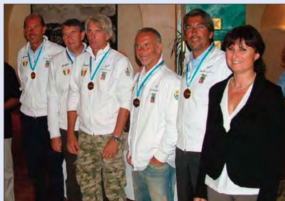
Men's 50 winners ASD Gradisca d'Isonzo with their gold medals in Arosa.

The Women's 50s event saw a repeat of last year's