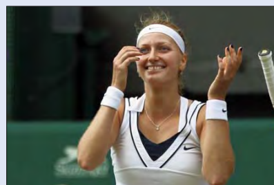
Petra Kvitova (CZE)