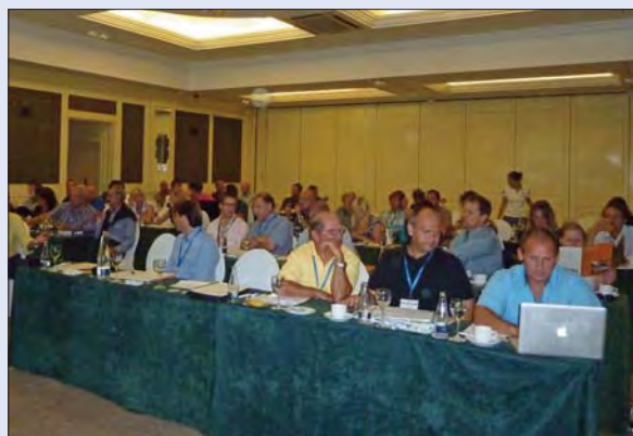
Above: delegates pictured during the meeting at La Manga Club.