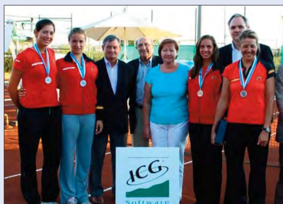
Above (from top), Winners Ukraine celebrate at the prize-giving ceremony, Spain show off their silver medals.

Full draws and results from the competition, plus a photo gallery can be found here at the Tennis Europe website.