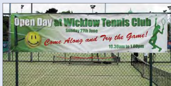
Place banners outside the club

'Our Open Day went very well, got around 20 new members, mostly juniors but the odd family membership as well which is always good. We found the Fastest Serve Competition attracted the most people on the day and was the best fun.' - North Ireland club.