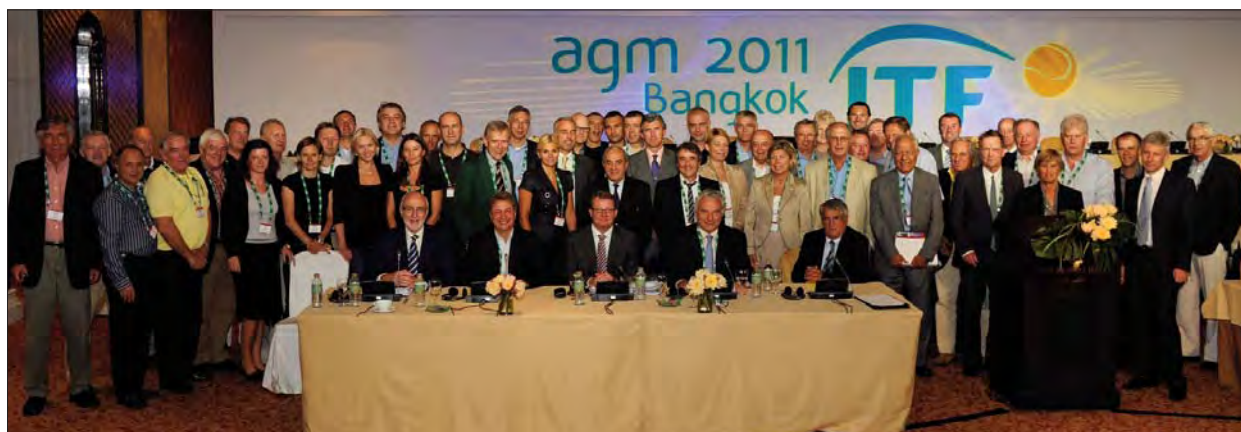
Above: Delegates at the Tennis Europe Regional Meeting in Bangkok, Thailand. See Page 2.