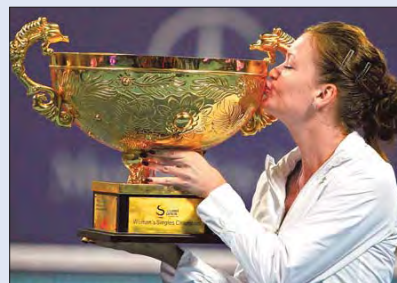
Agnieszka Radwanska (POL)