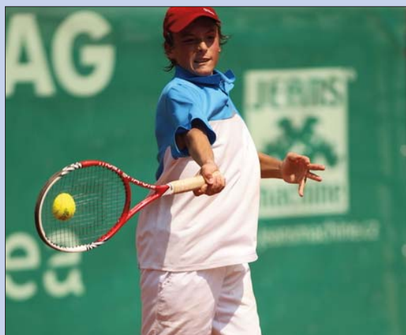
Stefanos Tsitsipas (GRE)