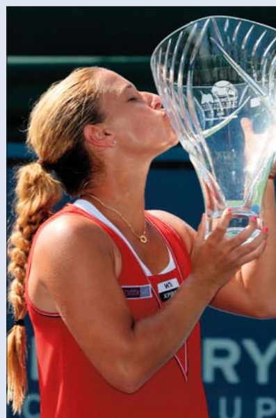
Dominika Cibulkova (SVK)