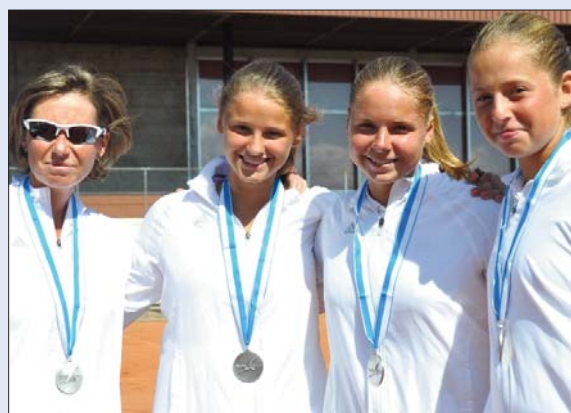
Above: Winners Russia with their trophy and runner-up Latvia with their silver medals.