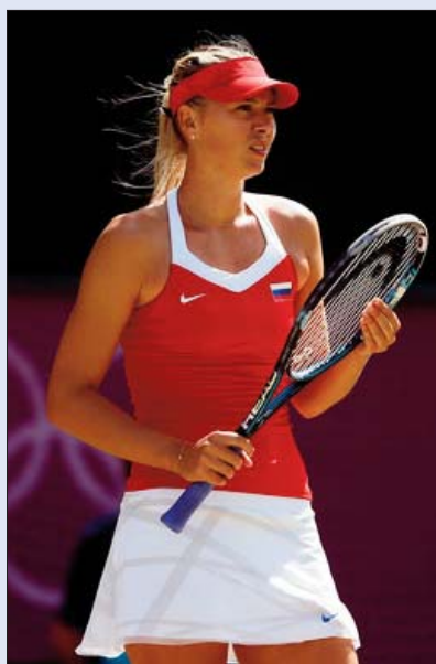
Maria Sharapova (RUS)