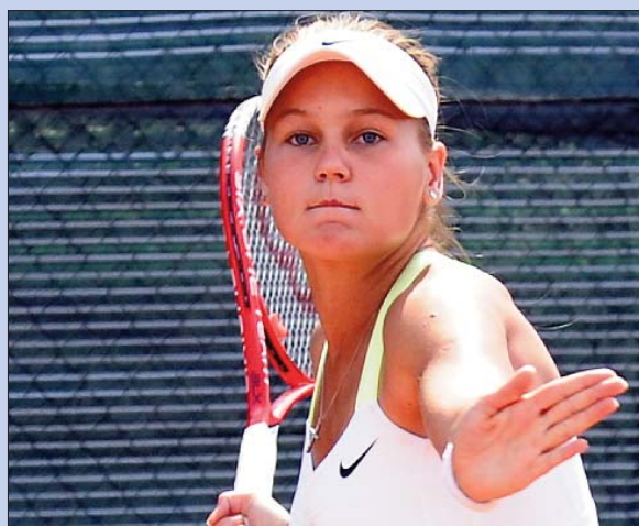
Veronika Kudermetova (RUS)