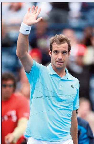
Richard Gasquet (FRA)