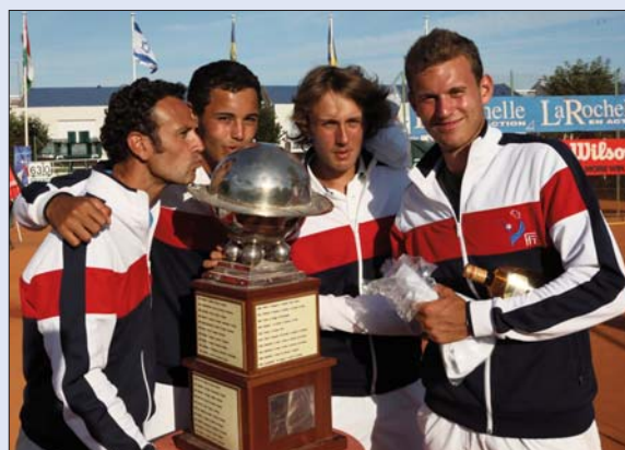
Above: The victorious Slovakian and French teams.