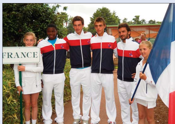
Above: the Italian and French teams in Le Touquet.

At the girls' finals in Leysin (SUI), Russia built up an impressive run that saw them progress through the competition without the loss of a single live match. The team opened their campaign at home in St. Petersburg, where they beat Estonia and Latvia 3-0 to win their qualifying group. Their good form continued at the finals, beating Romania 3-0 in their opening match before overcoming Germany by the same score.