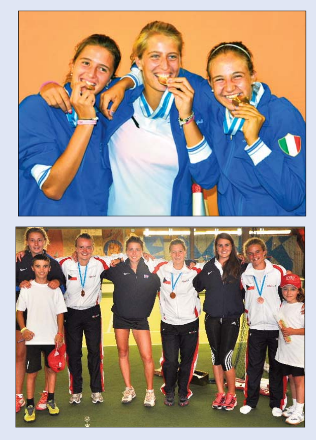
Above: (Top) Italy's team celebrates their first 16 & Under girls' Summer Cups win in over three decades, (below) British and Czech teams with ball kids on the final day.

rounds of the tournament, due to be held in San Luis Potosi in Mexico in September.