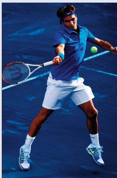
Roger Federer (SUI)