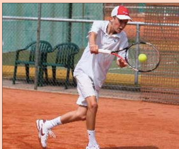
Stefanos Tsitsipas (GRE)