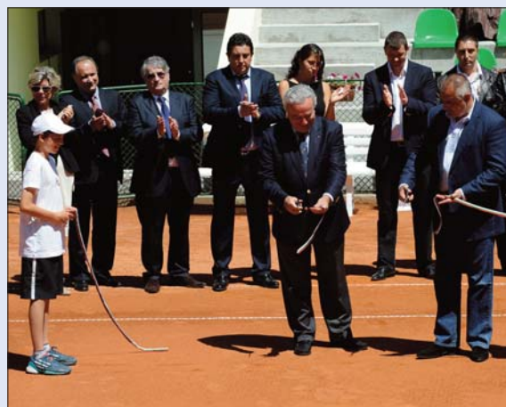
Dignitaries applaud the launch of the Centre in Sofia.