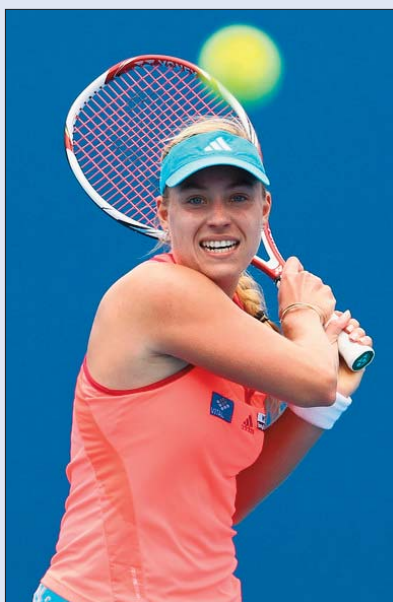
Angelique Kerber (GER)