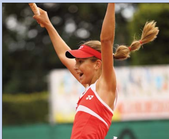
Belinda Bencic (SUI)