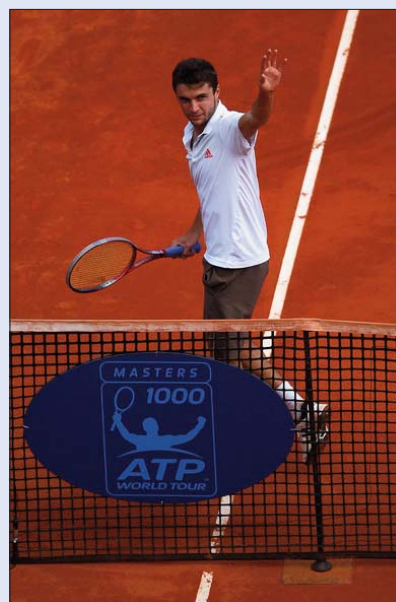
Gilles Simon (FRA)