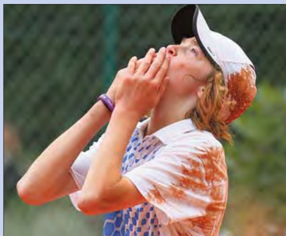
Andrey Rublev (RUS)