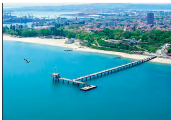
The city of Burgas (above) will be location for the forthcoming ITF World Beach Tennis Championships.