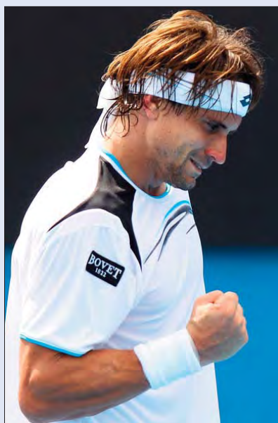
David Ferrer (ESP)