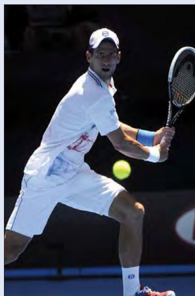
Novak Djokovic (SRB)