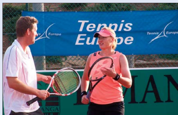
Baltacha and coach at La Manga Club in April.

It has been a great trip and being able to use the excellent facilities - courts, gym, pool and a bit of golf etc - as well as enjoy the famous La Manga Club hos-