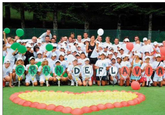
Flavia Pennetta visits the 2010 Summer Centre in Sestola.

Families can choose between the most conveniently located of the nine centers, and the dates ranging from mid-June and the beginning of August. The tennis activities designed by our National coaches, the presence of qualified instructors to coach the other sports and the full-time presence of a Health and First Aid team, are all high guarantees of reliability to par-