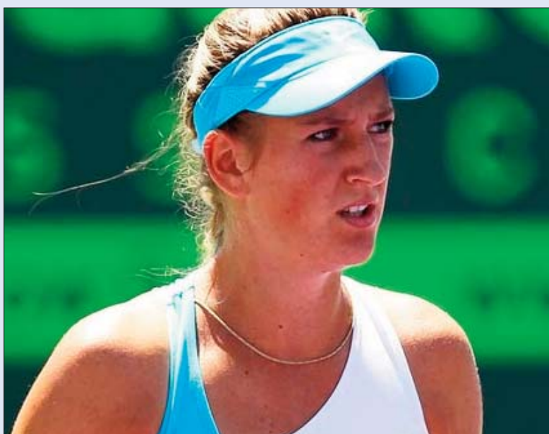
Victoria Azarenka (BLR)