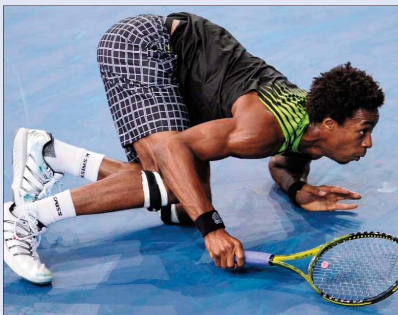
Gael Monfils (FRA)