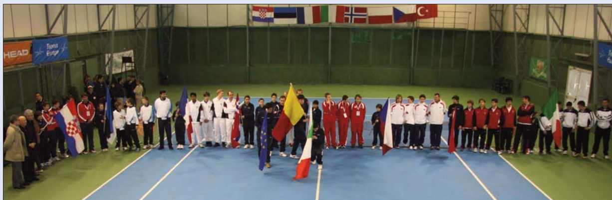
Above: The opening ceremony of the Boys 14 & Under finals in Ascoli, Italy.

<< with a team headed by Elena Dementieva, and broke a three-year drought in this age category.