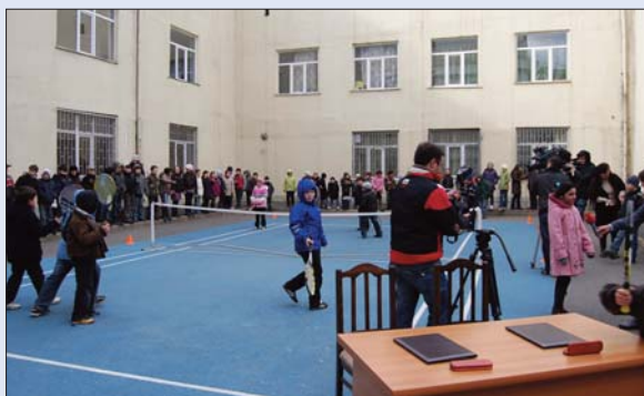
Above: Children at the first STI classes in Georgia.

The aim of the project is to increase the popularity of the sport by giving young children greater access to tennis facilities. Inter-school competitions will be organised and a focus will be made on the training of teachers to ensure that physical education coaches have a greater knowledge of the sport.