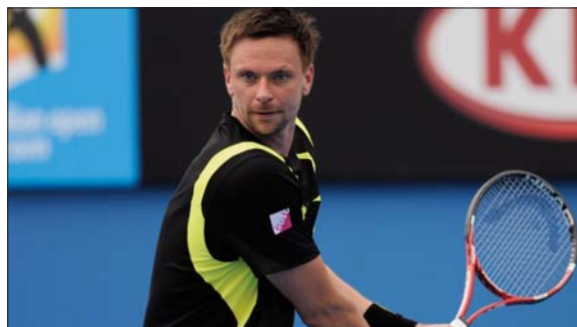
Above: Robin Söderling looks set to be Sweden's #1 player for some time to come, as the federation explores ways of getting more players to reach the elite level.

The STA's response to this challenge has been to unveil a massive investment in domestic tournaments, increasing the total numbers of ITF Pro Circuit events in Sweden from 6 to 14 (seven men's and seven women's) in just one year for the 2011 season. The aim is to further