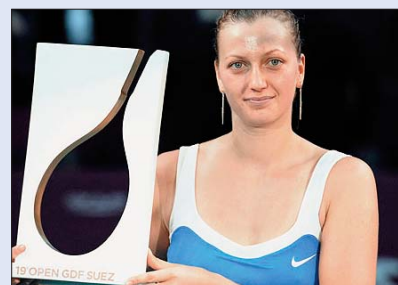
Petra Kvitova (CZE)