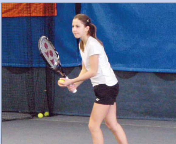
Belinda Bencic (SUI)