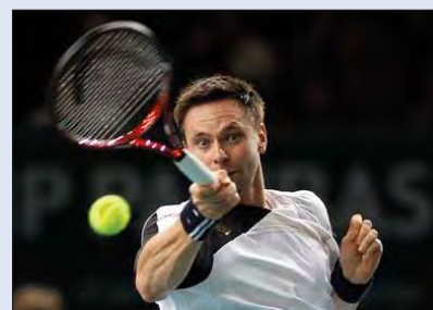
Robin Söderling (SWE)