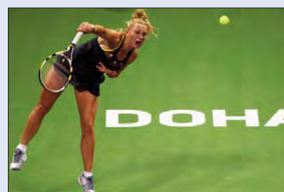
Caroline Wozniacki (DEN)