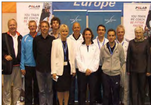
Some of the speakers pose at the Symposium in Moscow.

The 2010 'European Coaches Symposium powered by Polar' was held at the Russian State University of Physical Education, Sport and Tourism in Moscow during the weekend of October 15-17.