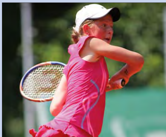
Jelena Ostapenko (LAT)