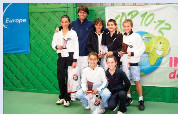
Many 12 & Under events will feature qualifying competitions for the first time in 2011.

Championships and Tennis Europe Junior Masters will be increased.