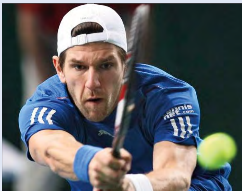
Jurgen Melzer (AUT)