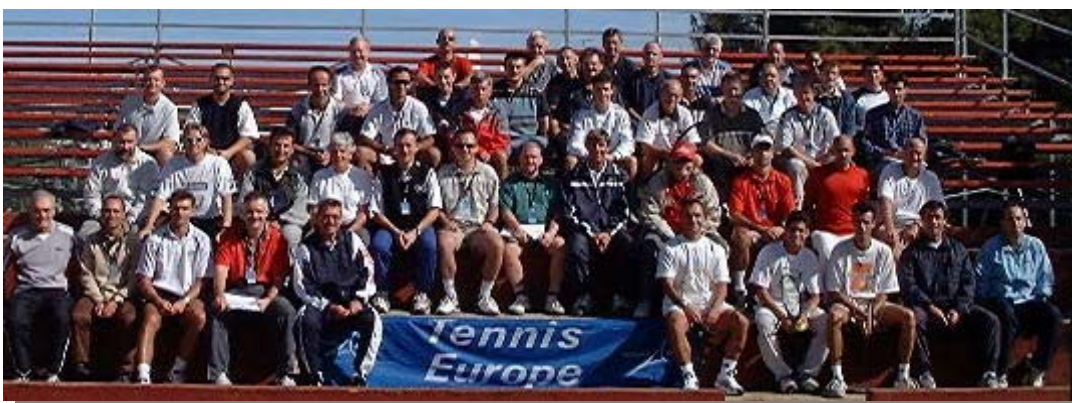
The delegates assemble for an on-court presentation in Vilamoura.

The third edition of the Tennis Europe's biannual European Specific Theme Conference was held in Vilamoura, Portugal from October 18-21 st , hosted by the Portuguese Tennis Federation. 50 delegates from 20 countries, plus special guests as far afield as Canada and Lebanon joined 11 speakers for two days of lectures and on-court demonstrations.