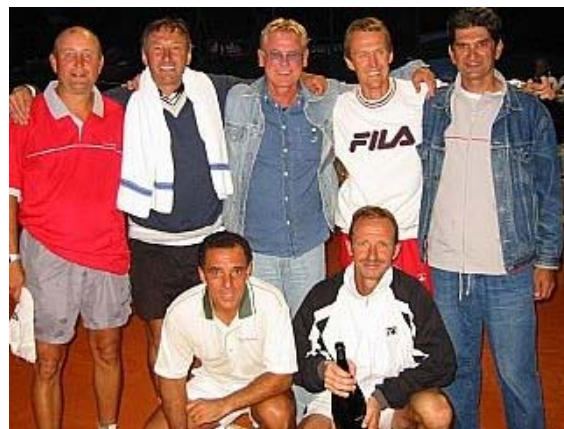
The team from TC Altenstadt celebrate victory

The latest Veterans rankings were published on October 1st, and can be found at the new look ITF website.