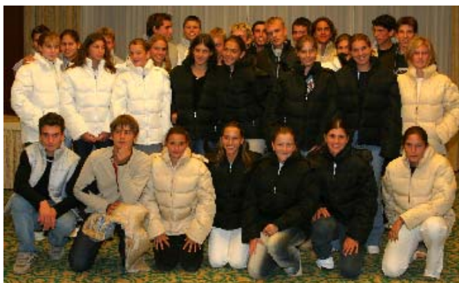
The elite of European U16 and U14 players gathered in Italy

Romanian players dominated the girl's competitions. The 14&U event would prove to be a battle between the two top players of the year, Sorana Cirstea and Raluca Olaru. Top seeded Cirstea won through to the final with a straightforward win