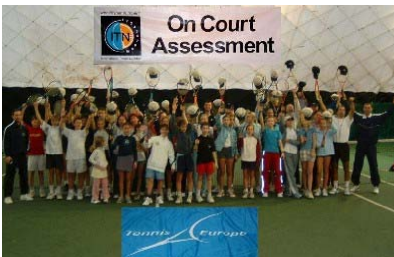
Hats off: the participants of the North East Training Camp

runs in the tournament, making their way to the titles without dropping a set.