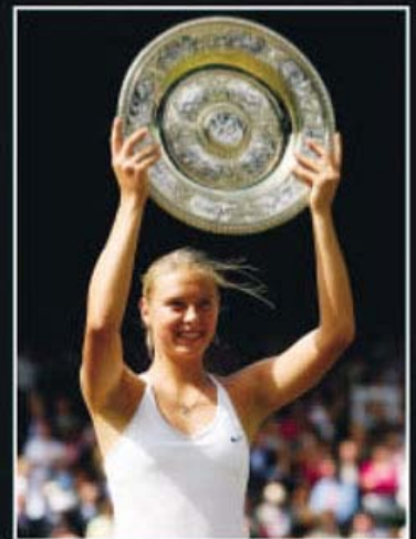
2004 WIMBLEDON CHAMPION MARIA SHARAPOVA TEAM SHARK PLAYER