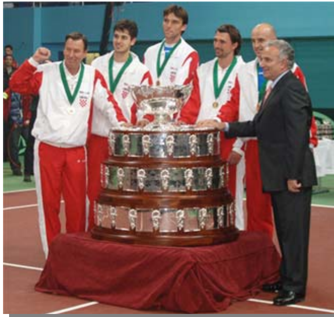
L-R: Captain Niki Pilic, Mario Ancic, Ivo Karlovic, Goran Ivanisevic, Ivan Ljubicic, International Tennis Federation President Francesco Ricci Bitti.

the 2006 event has already been made, with this years finalists both travelling to play away matches. Croatia will take on Austria in Graz, while the Slovaks face the daunting trip to Chile, who are unbeaten at home in a decade.