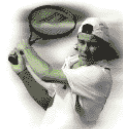
O 3 Tour played by Guillermo Coria

By replacing traditional pin-sized string holes with giant O-ports, our driven and never-satisfied engineers reinvented the tennis racquet again — creating a super aerodynamic frame with a more responsive stringbed. This increases the sweet spot by 54% which means you hit your best shots more often. What's truly impressive is that we did it all without enlarging the racquet head, increasing its length, or adding weight. So it's easy to manoeuvre and quicker through the air. Available in Silver for extra power, Blue and Red for all-around playability and the O 3 Tour for ultimate Tour control. Stop trying to hit a Sweet Spot. Start hitting a Sweet Zone. princetennis.com/O3 .