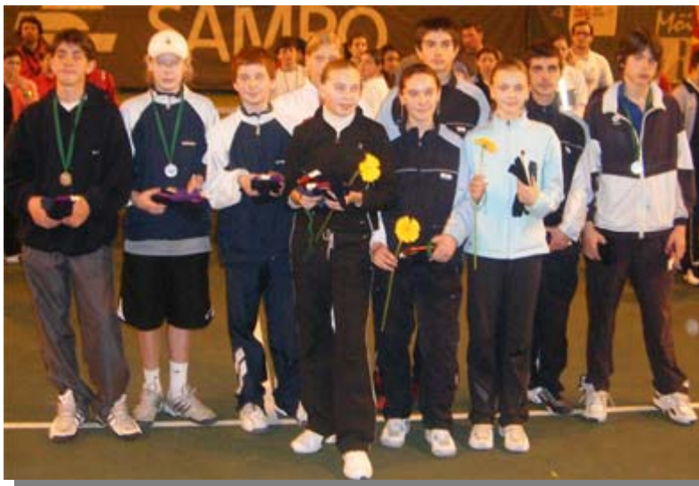
Winners of the first week's event in Tallinn