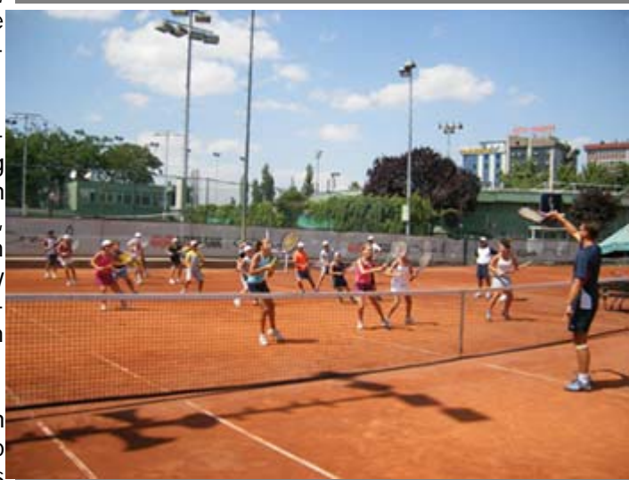
Players at the 12 & Under Training Camp in Ankara (TUR)