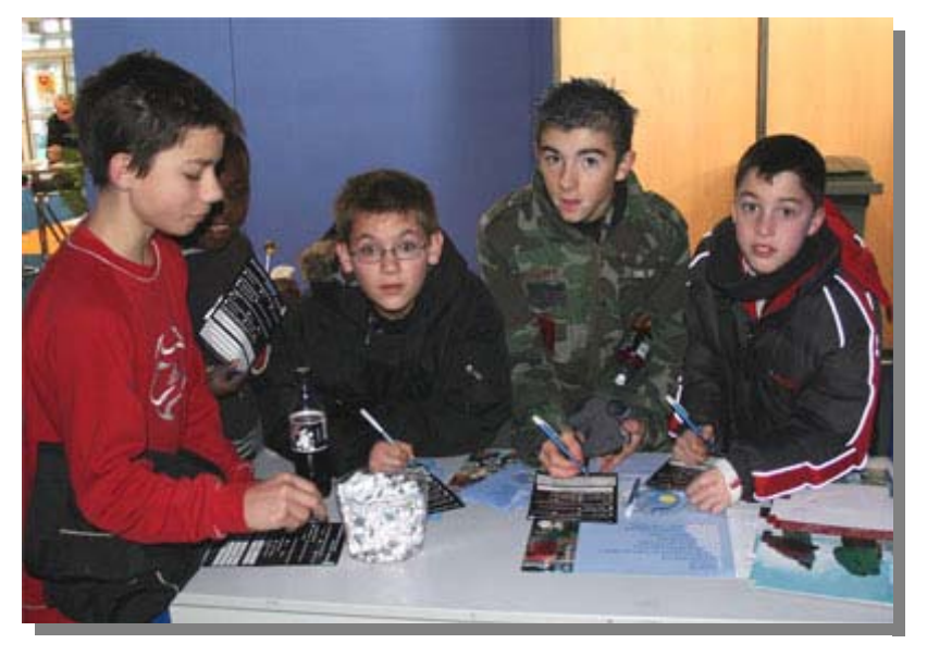
Tour players taking part in the survey at a tournament in France.

There were similar trends in terms of footwear, with Nike and Adidas once again dominating the preferences of the respondents, with 39% and 25% of the totals respectively. As before, both brands were markedly more popular amongst girls. Wilson (12%)