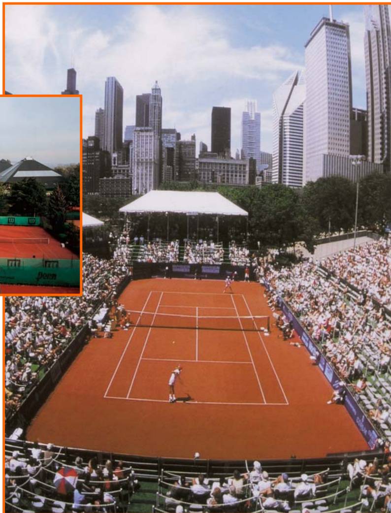
Chicago ATP Senior Tour

Low maintenance requirement, no water needed, payable all year round in all climates, comfortable, ITF approved.