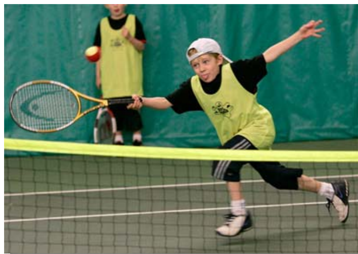
Starter players can be more effectively introduced to the game with red sponge balls, as above