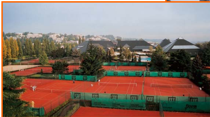
Tennis club des Pyramides (France)