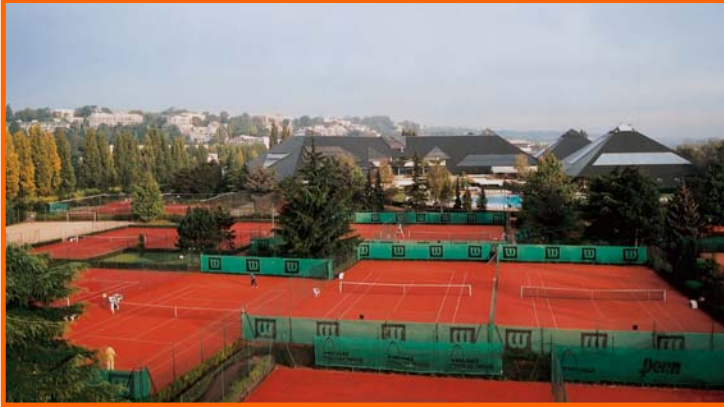
Tennis club des Pyramides (France)