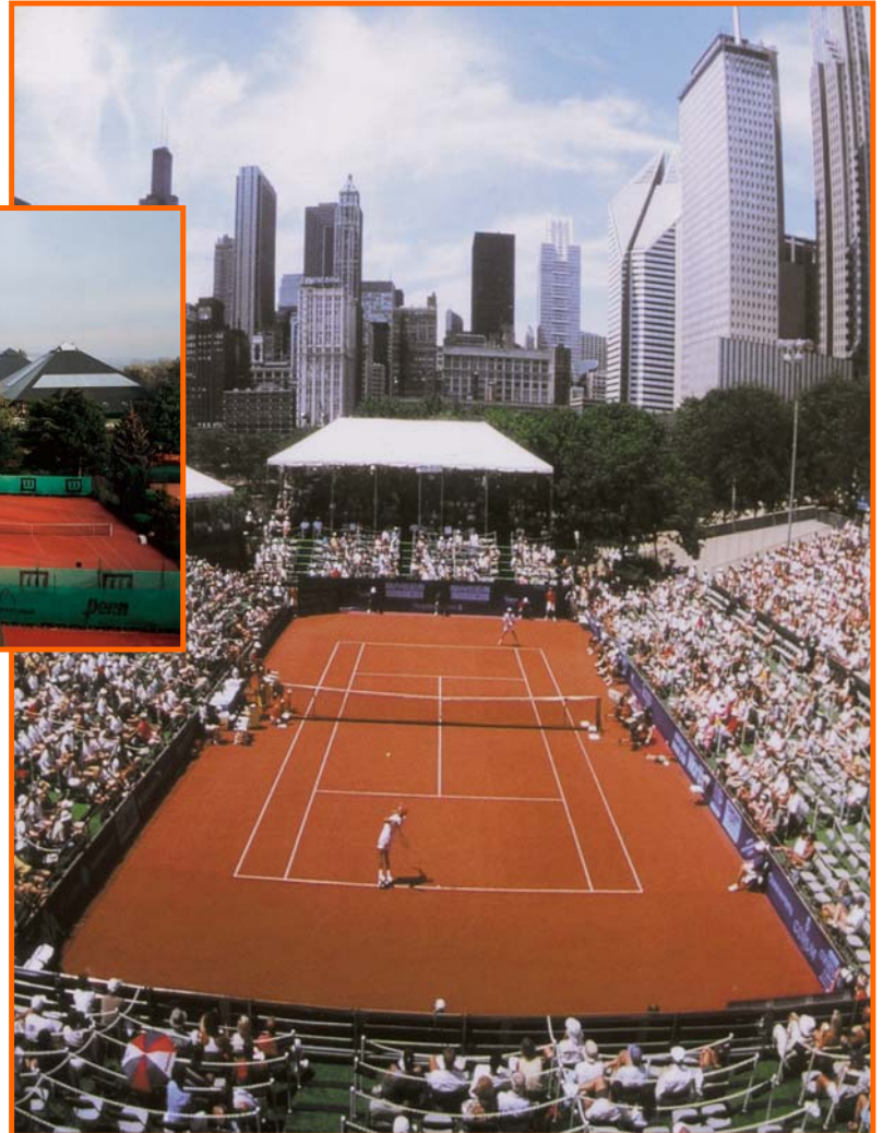
Chicago ATP Senior Tour

Low maintenance requirement, no water needed, playable all year round in all climates, comfortable, ITF classified Category 1 surface.