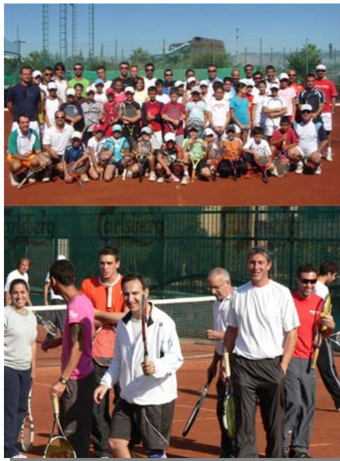
Above (top), Players and coaches in Antalya pose during a training camp, (below) Coaches enjoy an on-court session at a Workshop in Cyprus.