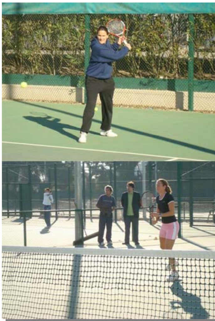
Top, former world #2 Conchita Martinez practices with Italy's Flavia Pennetta (bottom left) and top Israeli Shahar Peer (bottom right)

Tennis Europe's Academy Partner, the CIT is home to some of the best facilities in Europe, with 31 tennis courts, including greenset, indoors and clay, in grounds totalling some 31,000m 2 . It also has a professional school with a world wide reputation that prepares players to make the transition to professional