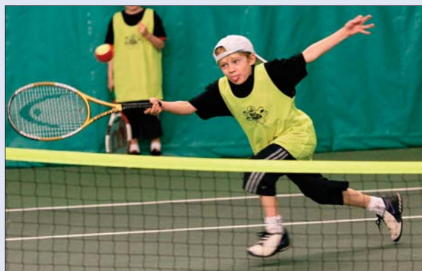
Players practising on 'red' courts with specially adapted balls

Full information and the official circular to member nations will be released in July.