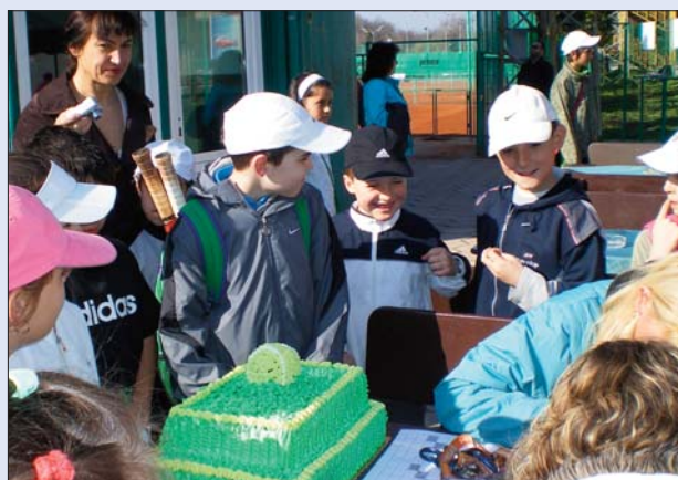
Kids enjoyed the green courts - and the green cake - in Plovdiv.

The next green court competitions with green balls took place a week later on the 11th of April in Haskovo and Sevlievo.