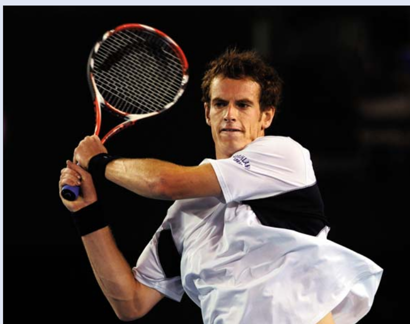
Andy Murray (GBR)