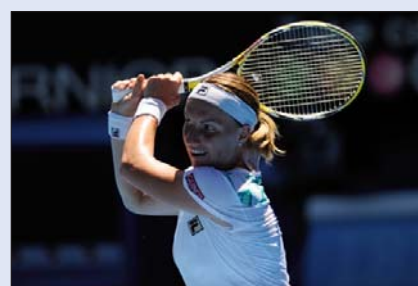
Svetlana Kuznetsova (RUS)