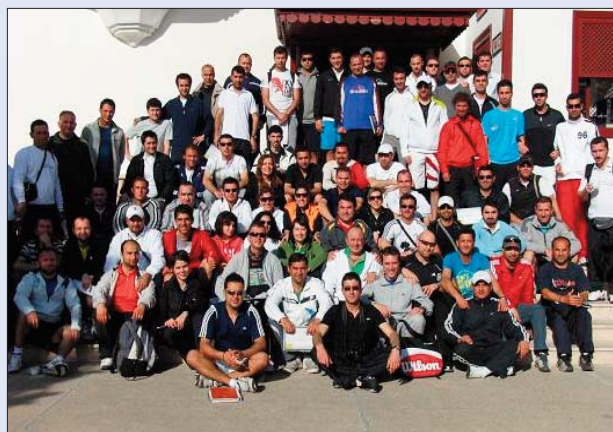
Coaches take a break in Antalya