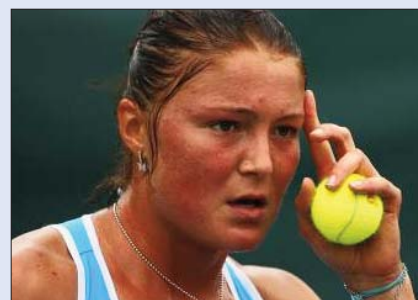
Dinara Safina (RUS)