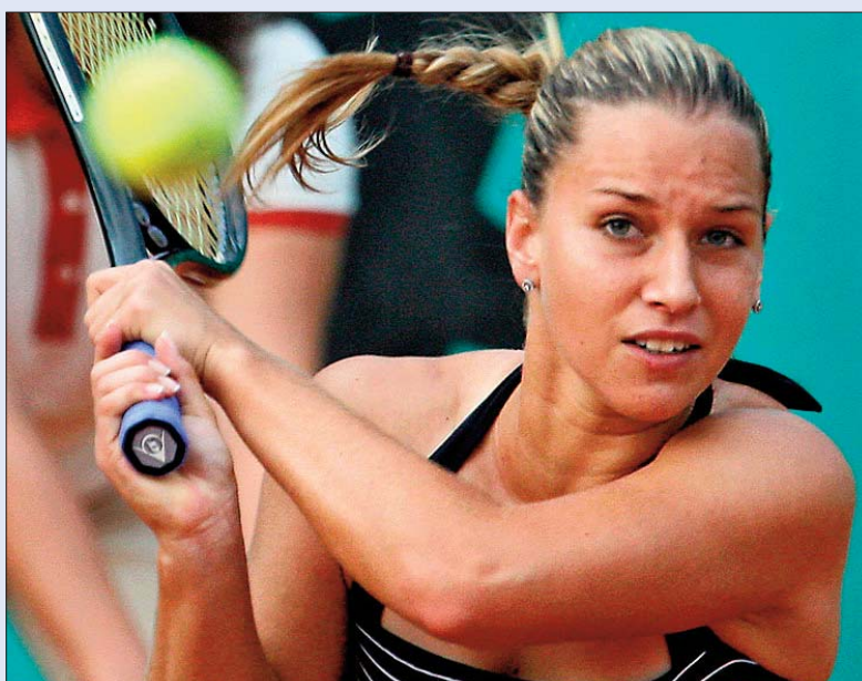
Dominica Cibulkova (SVK)