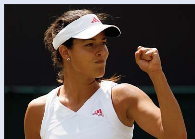
Ana Ivanovic (SRB)