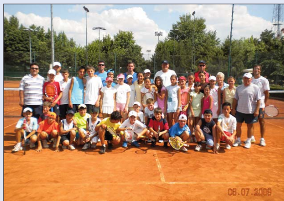
On court in Ankara