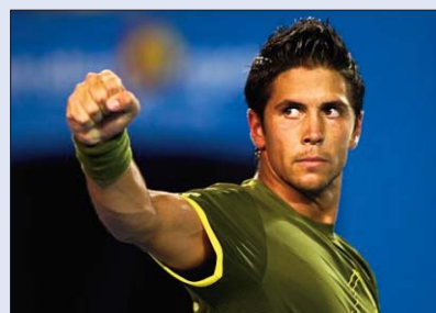
Fernando Verdasco (ESP)