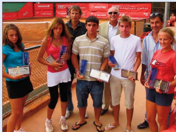
Above: Players collect their prizes at the Sanchez-Casal Academy tournament.