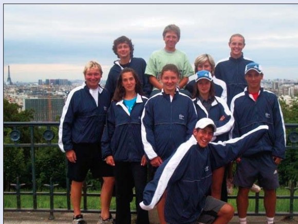
Above: The 14 & Under Team take time out to enjoy the sights of Paris.

During the third week of the Tour, the ITF/Tennis Europe Team split for two tournaments.