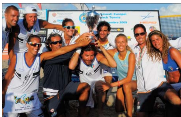
Above: The victorious Italian team celebrates. Below: Mixed doubles winners accept their trophies.

In the Men's Doubles competition the only non-Italian team in the semi-finals were the powerful Spaniards >>