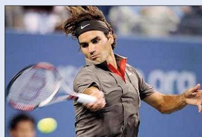
Roger Federer (SUI)