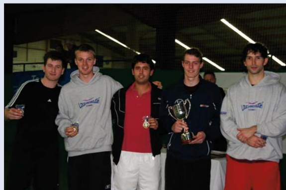
Above: Loughborough University Mens Team celebrate their win. Below: all participants at the finals at Gosling HPC.