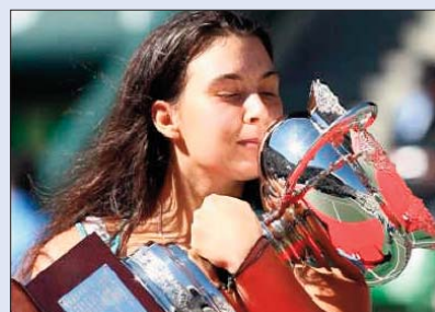
Marion Bartoli (FRA)