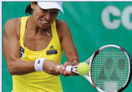
Kimiko Date-Krumm (JPN), one of several former top players to use the ITF Pro Circuit to launch successful comebacks in 2009.

Singles titles won by Wild Cards: 26 (13 mens, 13 womens).