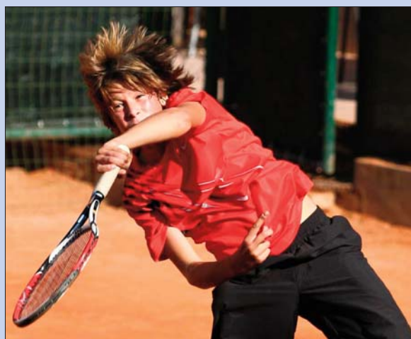
Gianluigi Quinzi (ITA)