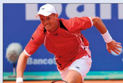
Nikolay Davydenko (RUS)