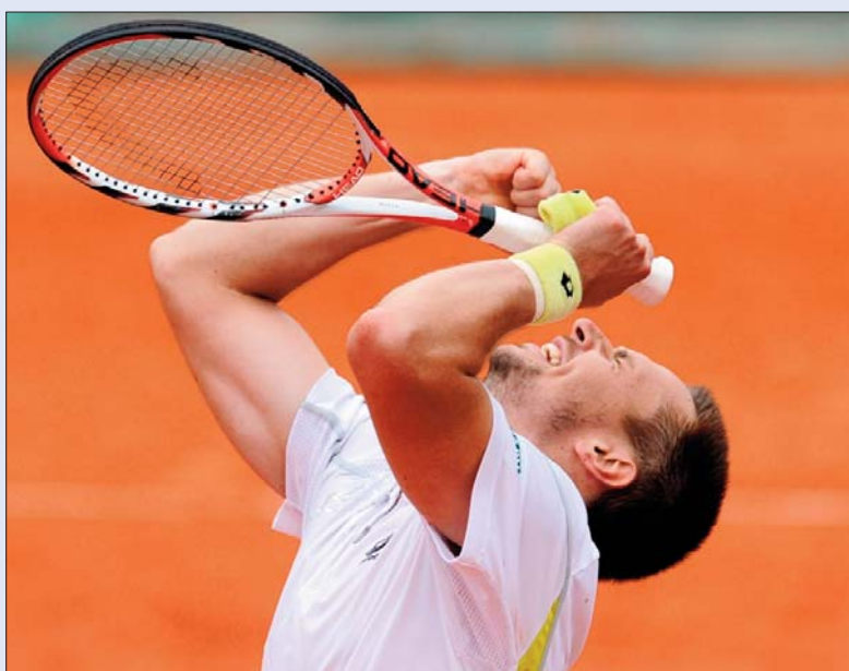
Robin Soderling (SWE)