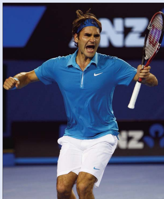
Roger Federer celebrates another historic win.

Having started the tournament with injury worries following an uncharacteristically meek loss to Elena Dementieva in the Sydney final the previous week, during which Williams sported a heavily-strapped knee, the world #1 was initially in imperious form, blasting her way to the last eight for the loss of just fifteen games. Quarter final opponent Victoria Azarenka looked on course to record an upset, as the seventh seed led 6-4 3-0 before Serena launched one of the finest comebacks of her career to clinch the second set on a tie break and finally gain control of the match in the decider. Serena then played well at the key moments in a tight semi final match with Na Li, edging past the Chinese #1 (and newest entry to the world's top ten) 7-6 7-6 to set up the hotly anticipated final with Justine Henin.