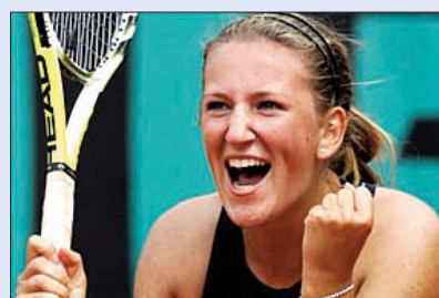
Victoria Azarenka (BLR)