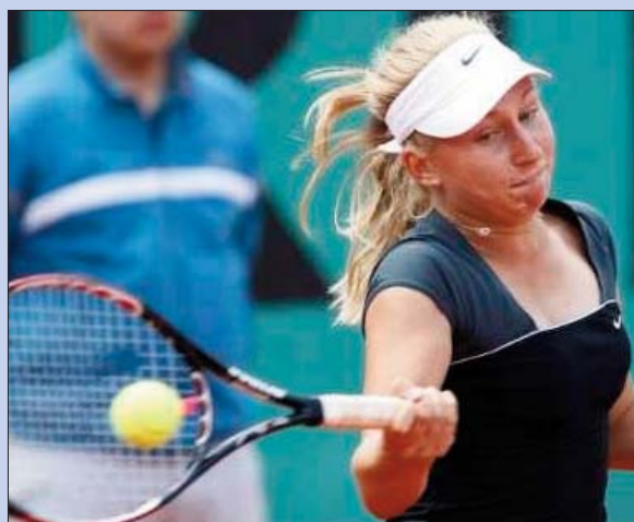
Daria Gavrilova (RUS)