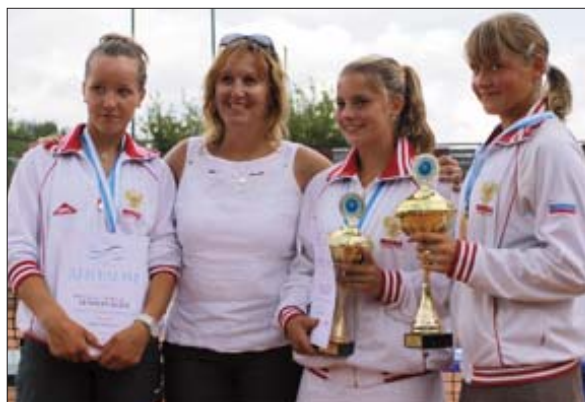
Russia's 16 & Under girls, who swept the European Junior Championships last year, securing yet another Junior Tennis title.