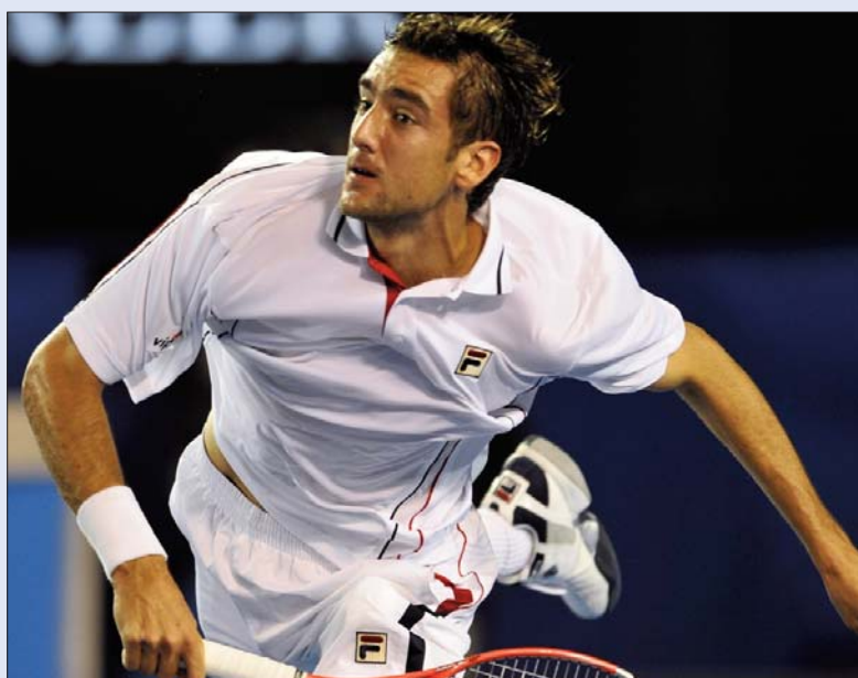
Marin Cilic (CRO)