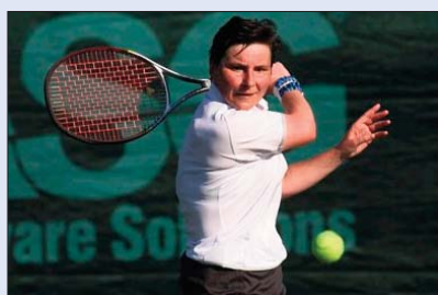
Olga Shaposhnikova (RUS)