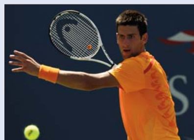
Novak Djokovic (SRB)