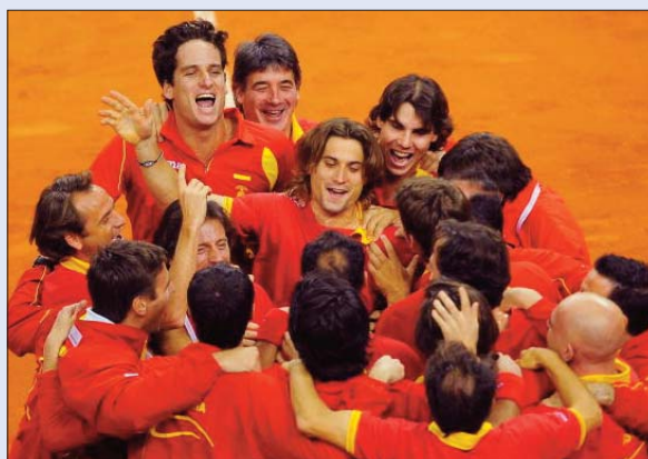
Spain's Davis Cup title went some way to securing the Professional Tennis Trophy.