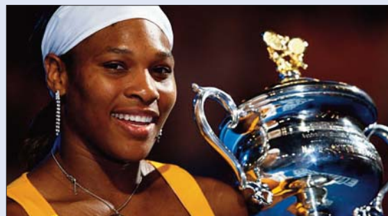
Above: Serena Williams lifts the Daphne Akhurst trophy for the fifth time. Below: Karolina Pliskova celebrates her first junior Grand Slam win.

With the leading men jostling to establish a pecking order behind Federer at the top of the rankings, and Belgium's comeback queens Henin and Clijsters having already demonstrated that they are key Grand Slam contenders, 2010 is already shaping up to be a memorable year for the sport.