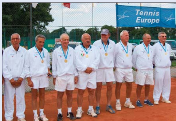
Above: (top) Men's 60s champions TC Lese Grün Weiss Köln with their trophies, Men's 65s winners CT Palermo.