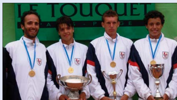
Above (top), The Russian team celebrates victory in Leysin, (below) French boys re-write the record books in Le Touquet.