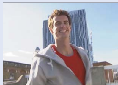
Andy Murray (GBR)