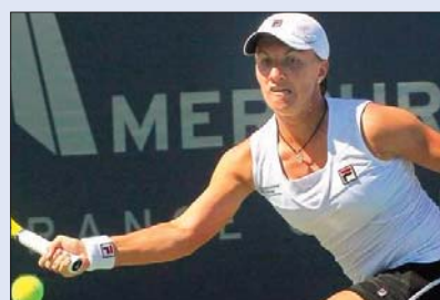
Svetlana Kuznetsova (RUS)