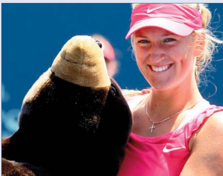
Victoria Azarenka (BLR)