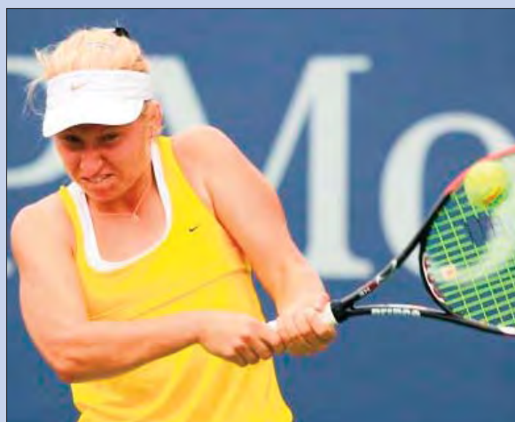
Daria Gavrilova (RUS)