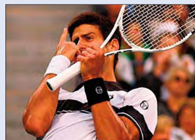
Novak Djokovic (SRB)