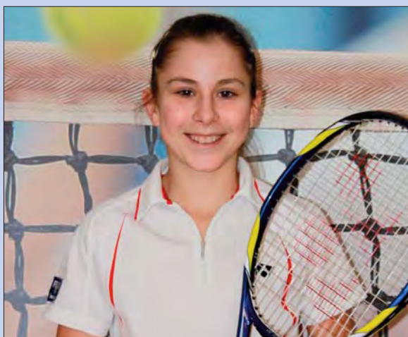
Belinda Bencic (SUI)