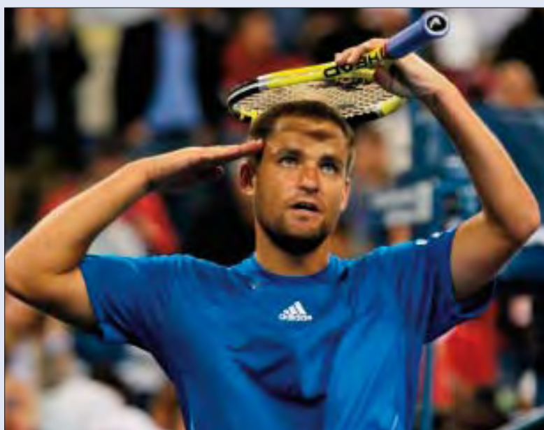
Mikhail Youzhny (RUS)