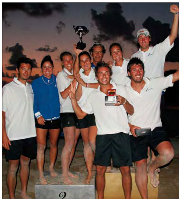
Italy's medal-winning teams celebrate in Antalya