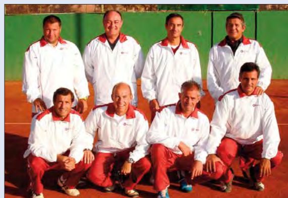
Above: Men's 45 Champions Cercle Sabadelles 1856.

Several of the remaining 2010 European Senior Club Championships age categories are still to be played, with the Men's 55 event being played in Arosa, Switzerland this week. All three women's events