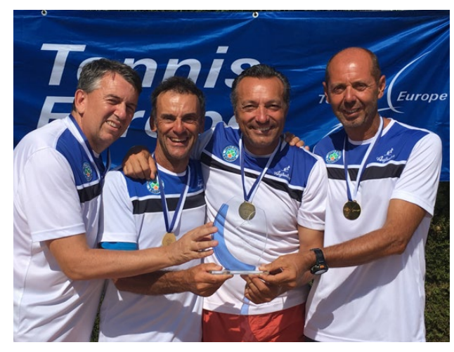
2016 Men's 50 champions Quadrifoglio (ITA).

The European Senior Club Championships are being held in cooperation with Patricio Travel, Tennis Europe's of-