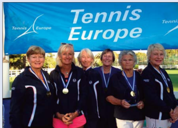
Photos: (left to right) Men's 60 champions Sergiev Posad (RUS) and Women's 65 winners Lagardère Paris Racing.