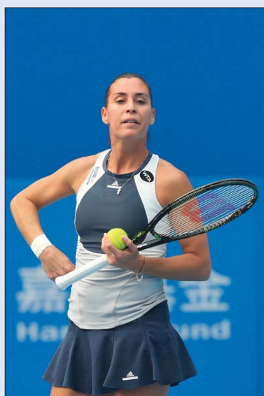
Flavia Pennetta (ITA)