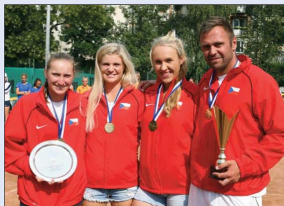
The German and Czech 16&U teams show off their gold medals.