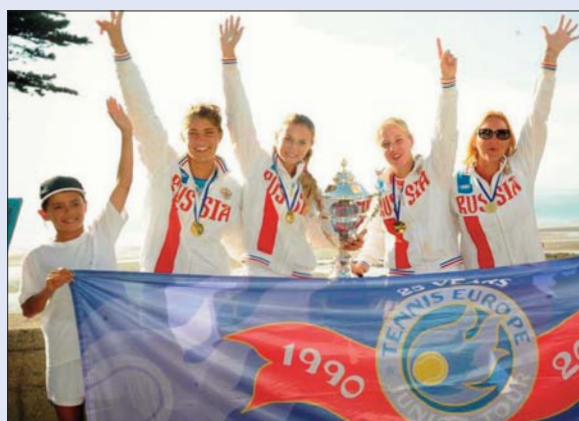
The Slovakian and Russian 18&U teams celebrate their wins.