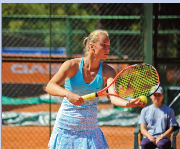
Elena Rybakina (RUS)