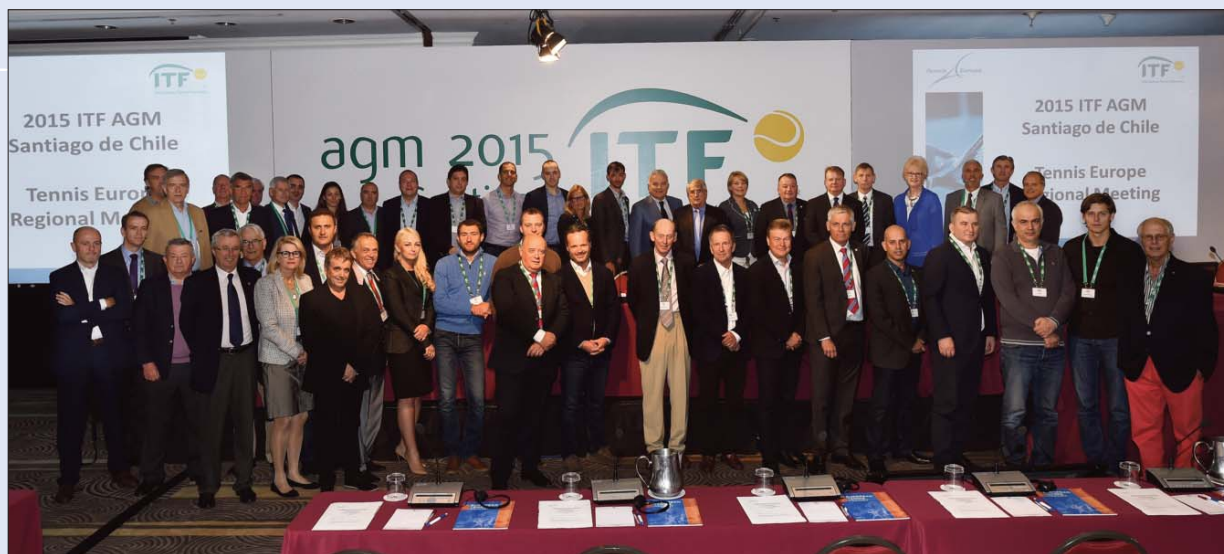
The Tennis Europe regional meeting in Santiago.