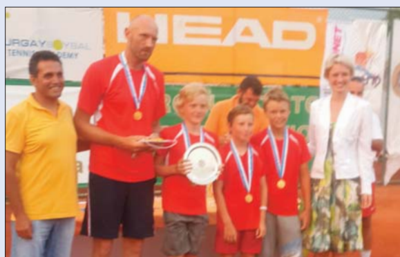
Winning teams from Ukraine (top) and Denmark.