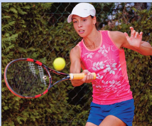
Viktoriya Petrenko (UKR)