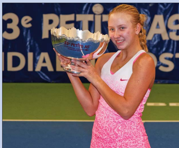
Anastasia Potapova (RUS)