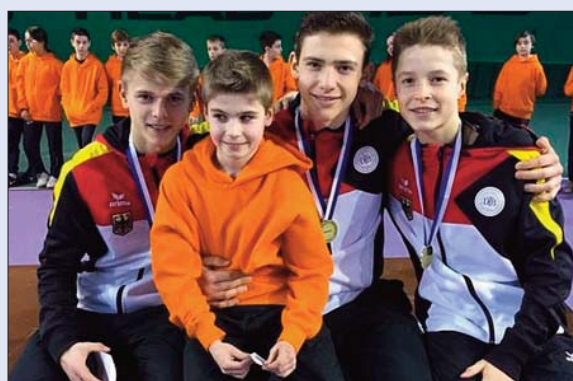
16&U girls' champions Russia and boys' winners Germany.