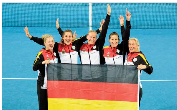
Germany reached the Fed Cup final for the first time in over 20 years, also achieving similar results in junior team competitions.