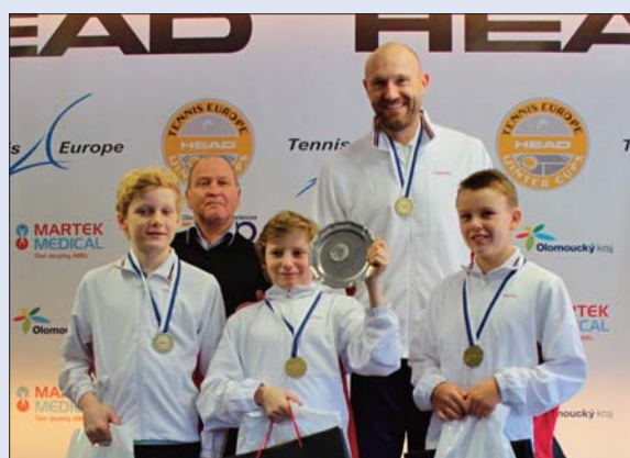
Photos: (from top) The victorious Girls 12&U Ukrainian team and Boys 12&U Danish teams.