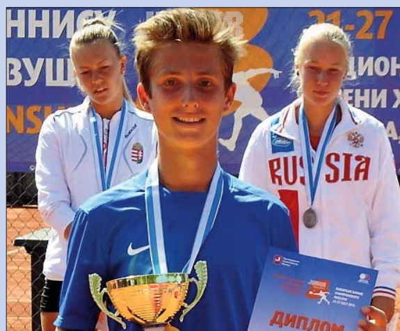
Corentin Moutet (FRA)