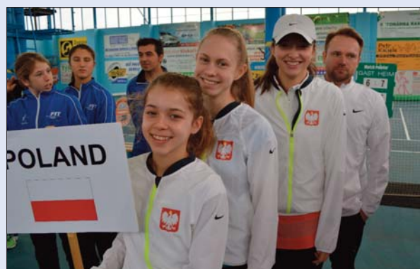
14&U boys' champions Russia and girls' winners Poland

stretched his win/loss record to 3-1 over his young rival.