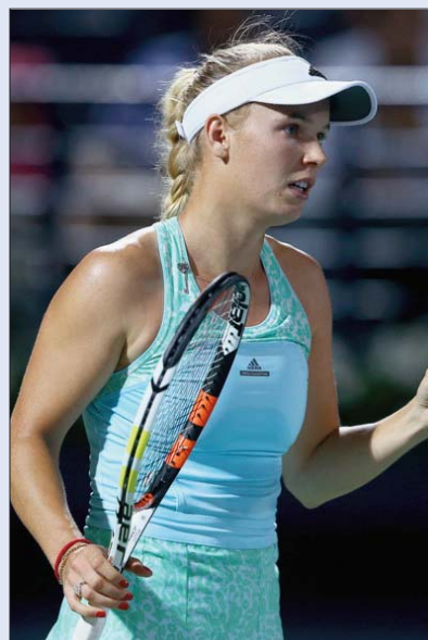
Caroline Wozniacki (DEN)