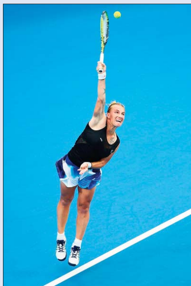
Svetlana Kuznetsova (RUS)