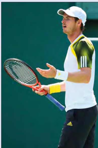
Andy Murray (GBR)