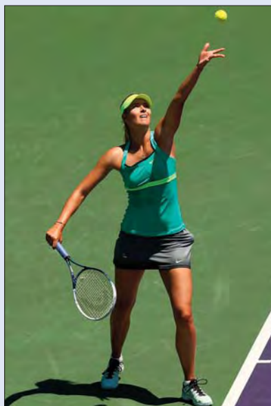
Maria Sharapova (RUS)