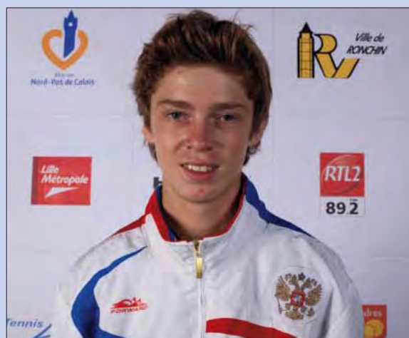
Andrey Rublev (RUS)