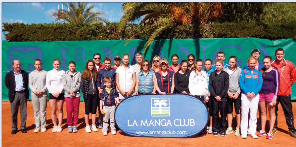
Members of the Russian team and La Manga Club staff.

The resort boasts unrivalled facilities as a sport and leisure venue including three 18-hole championship golf courses, a 28-court tennis centre and a 2,000sqm spa and fitness centre. It also offers the choice of a five-star hotel, four-star serviced apartments and townhouses, more than 20 bars and restaurants and is great fun for children.