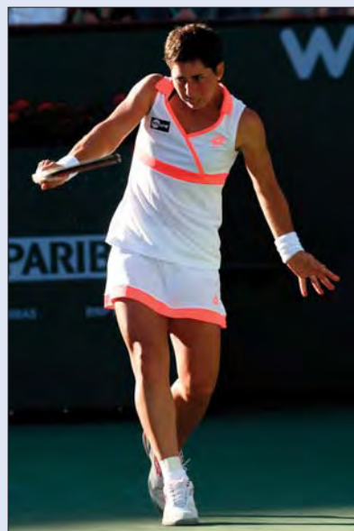
Carla Suarez Navarro (ESP)