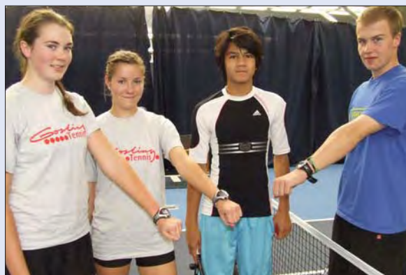
Heart rate monitors are an essential tool in the optimisation of fitness training.