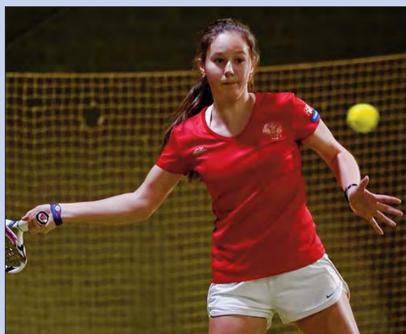
Darya Kasatkina (RUS)