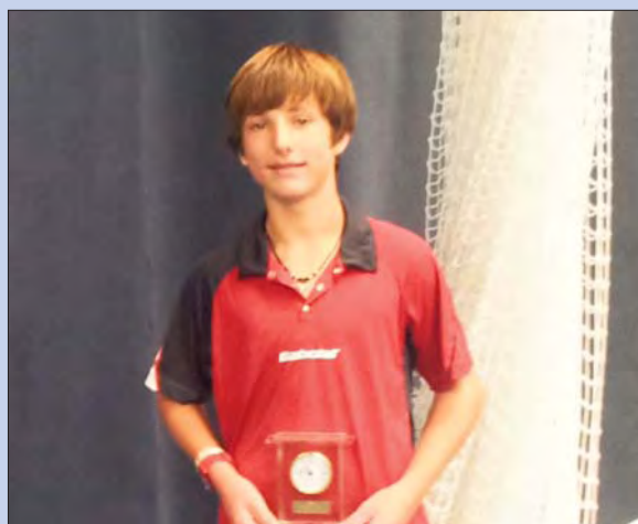
Corentin Moutet (FRA)