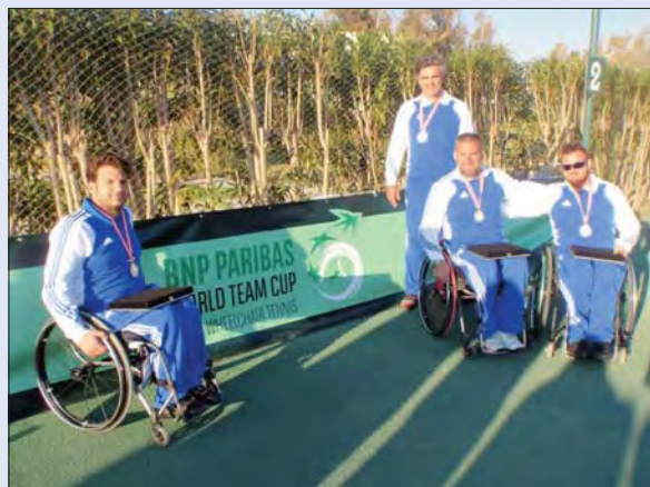
The Greek men's team celebrates in Antalya.

The experienced Spanish pair then went on to claim a decisive win in the doubles match, ensuring their nation a 10th appearance in the World Group. Greece will be joined by fellow regional qualifiers Nigeria and Canada in the men's World Group 2, while