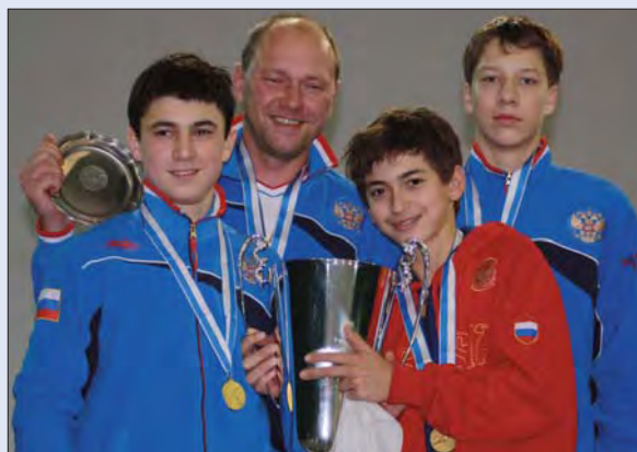
Above: Russia's 14 & Under boys' team celebrates in Correggio.