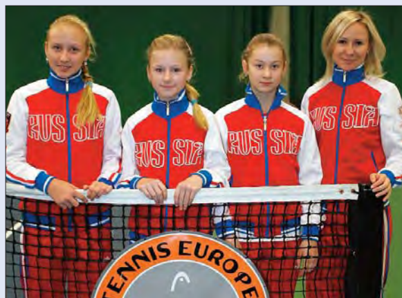
Above: Russia's victorious girls' team in Sheffield (GBR).

The final of the boys' event in Roznov pod Radhostem (CZE) was a much closer battle, with Great Britain having to come from behind to become the first-ever non-Russian winners of this new age category of the competition. The Brits had opened their campaign with 3-0 wins over Hungary, Ukraine, Austria and Poland before beating Belarus 2-1. Their Serbian opponents had served notice of their intent by winning their qualifying group in Kazan (RUS) by defeating the hosts and defending champions 3-0 in the final match.