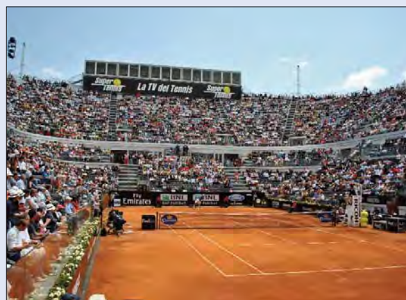
The Foro Italico in Rome.

The entry fee is €100, and the deadline is 14 April.