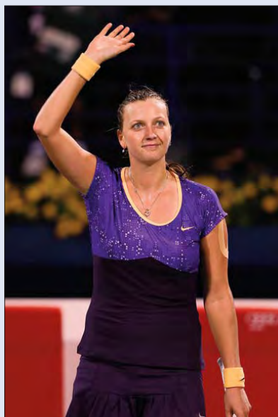
Petra Kvitová (CZE)