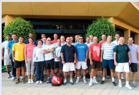
Some of the delegates at the most recent Specific Theme Conference in Vilamoura.

The conference will be open to delegates from all 49 Tennis Europe member nations, and will be of particular interest to those working in charge of coaches' education at national federations.