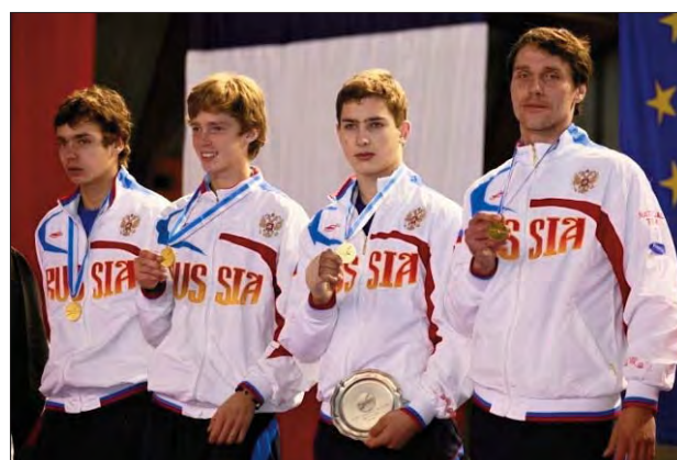
Clockwise from top left: Winning teams from Great Britain (Boys 12), Czech Republic (Girls 14), Russia (Boys 16), and Switzerland (Girls 16).