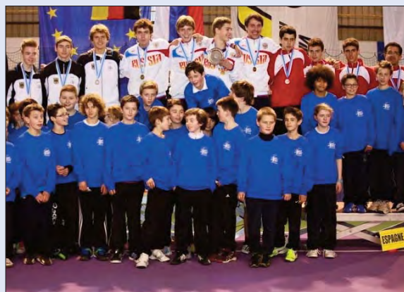
Players from Germany, Russia and Spain were joined by ball kids on the podium in Ronchin.

Darya Kasatkina put the top seeds ahead with a