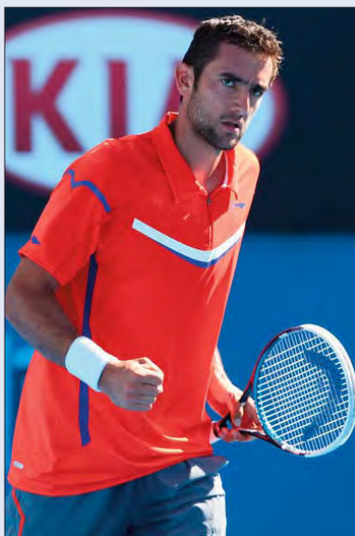
Marin Čilić (CRO)