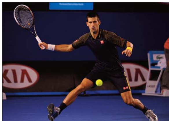
Djokovic during the final with Murray.

Nerves looked to be affected the defending champion in the early stages of her final with Na Li, the Chinese player taking the first set with some aggressive hitting that repeatedly found the lines. With the crowd clearly on the side of Li – who later commented that she saw so many flags she felt like she was playing at home – Azarenka then had to keep her