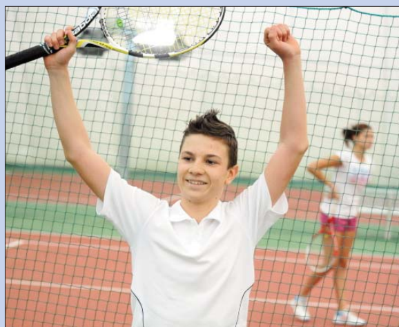
Miomir Kecmanovic (SRB)