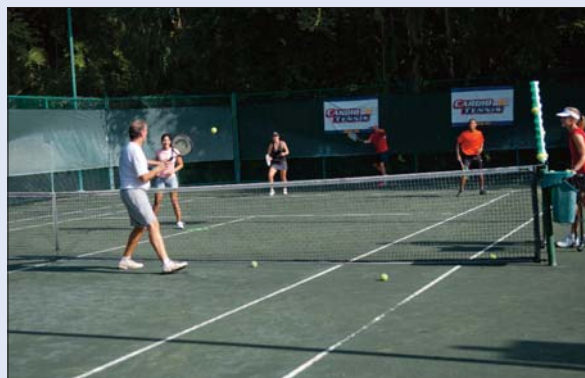
Training Courses in Ireland, Poland, Greece and Turkey.

The number of officially-certified Cardio Tennis instructors in Europe has also boomed, with Germany and Great Britain leading the way with over 1,200 and 1,000 coaches respectively. Both federations are TIA Cardio Tennis Affiliate Partners, and have many more instructor training courses planned throughout the rest of 2013. In Portugal, the first European country to embrace Cardio Tennis, the sport is played across the country and has proven to be a revenue generator for clubs. The TIA has delivered additional Cardio Tennis