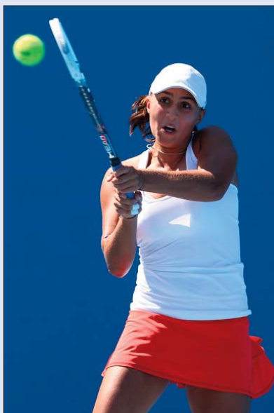
Tamira Paszek (AUT)