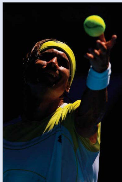
David Ferrer (ESP)