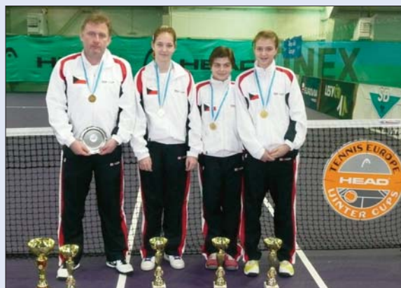
The Czech 14 & Under girls' team show off their medals and trophies after winning the 2012 competition.

The 12 & Under final rounds will be held in Sheffield,